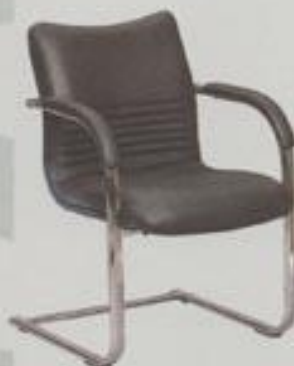
F 3020 CP