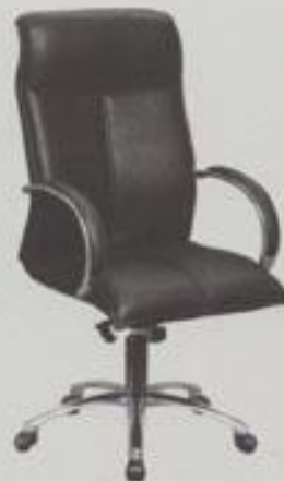
F 3004 AL