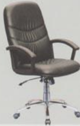
F 3001 AL