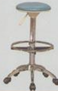
F 4019 HR