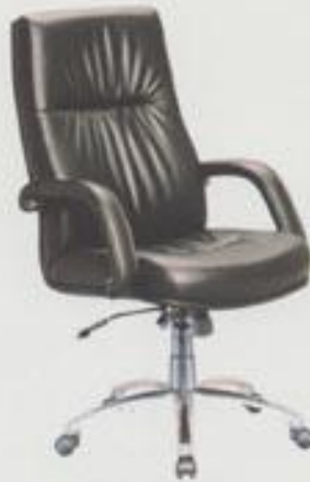
F 3002 AL