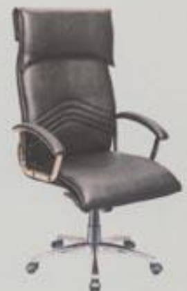
F 3005 AL