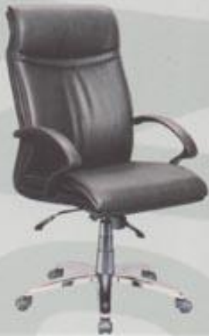
F 3006 AL