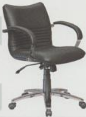
F 3019 AL