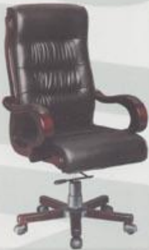
F 3009 L