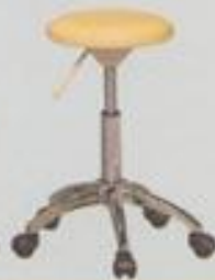
F 4018 H