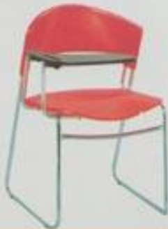
F 4012 ST