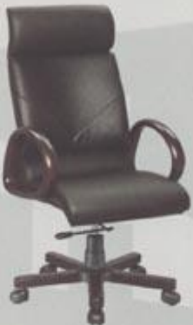
F 3022 L