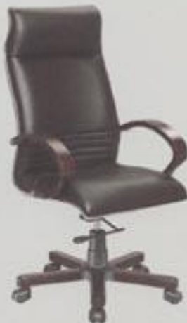
F 3021 L