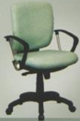
F-3034 (secretary chair)