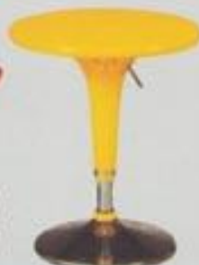
M 5 (Hydraulic)