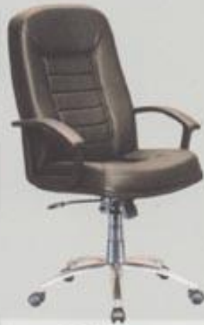
F 3003 AL