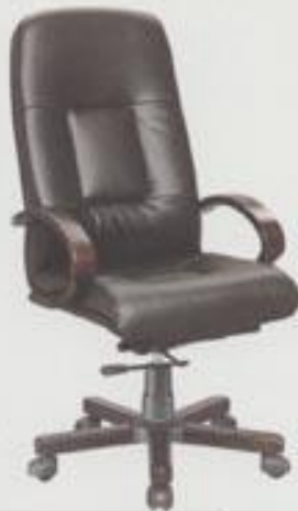
F 3023 L