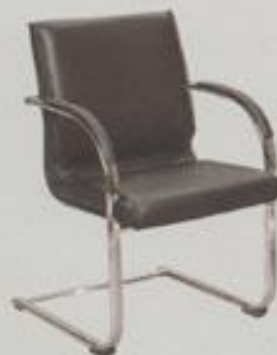
F 3017 CL