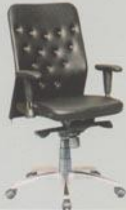
F 3012 ALL