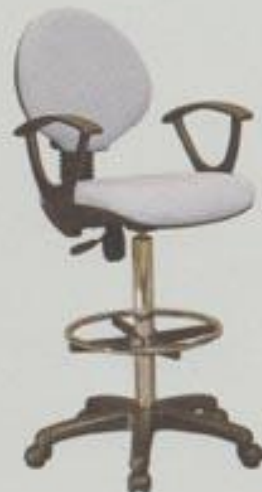
F 4007 MA