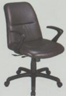
F 3013 (Rec Back)