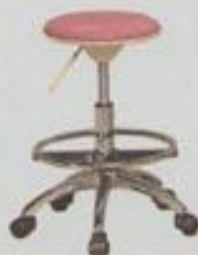
F 4018 HR