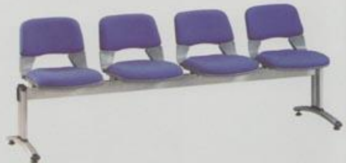
F 4036 / 4 Seat