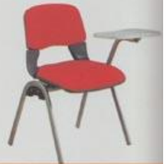
F 4035 ST