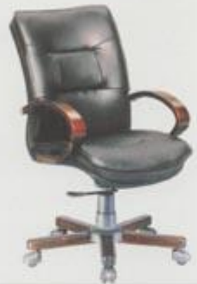
F 3010 L