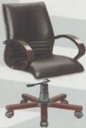
F 3016 L