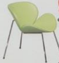
F 4015 L