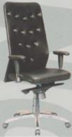
F 3007 ALL