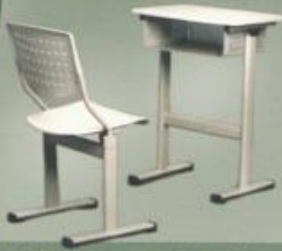
SC (Student Chair)