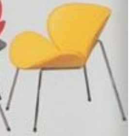
F 4015 L