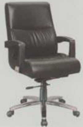
F 3018 ALL