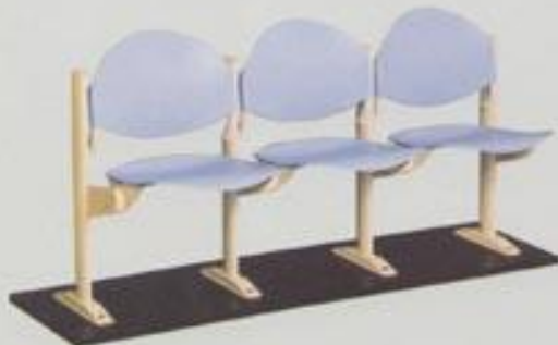
F 4023 (Rec-Seat)